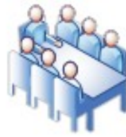
Board of Directors